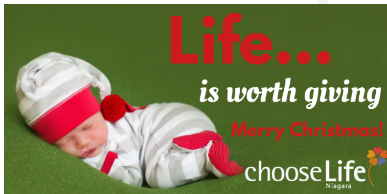
This Christmas billboard was seen in 8 locations throughout Niagara in December.

Check ChooseLife.ca/Events for upcoming pro-life events